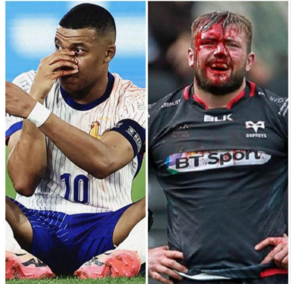
Football 'I am injured' - Rugby 'It's a mere scratch!'

Herts Hash House Harriers Herts official Website: hertsHash.co.uk