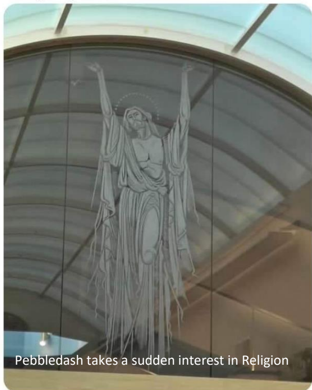
Pebbledash takes a sudden interest in Religion