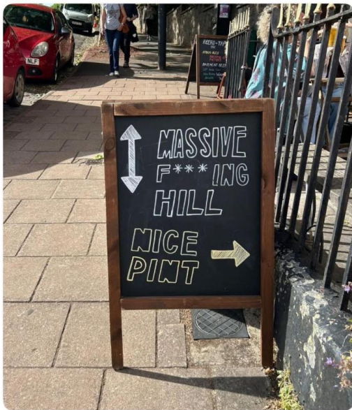
A very British pub sign

blocks, the very last block was a pretty large beast, seeming to be similar to those at Stone Henge with aching legs, the very same trailing limbs that had to be physically hauled by hand over this rectangular rock, then it was down the corresponding flat stone steps on the other side to get back to cut grass.